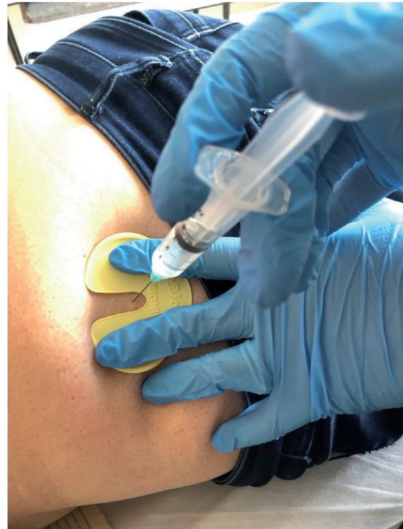
Figure 1 - Intramuscular injection with the use of ShotBlocker.

Cold spray group. In this group, injection was performed after administering the cold spray (Anticare, BSN Medical Ltd., East Yorkshire, UK) to the site of injection with a distance of approximately 15 cm