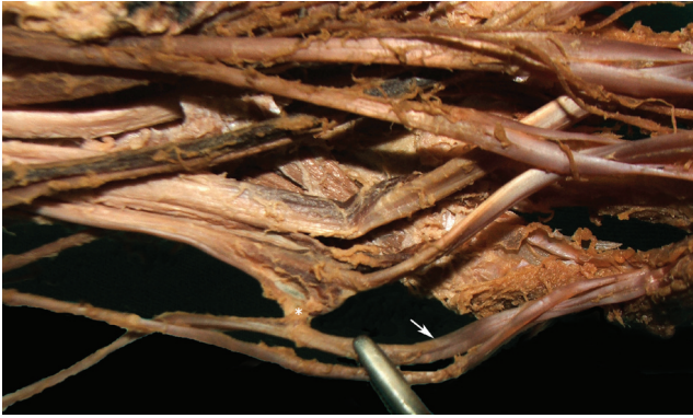
Figure 2 - Close view of the connection between the anomalous tendon and the FDP tendon to the ring finger. The white arrow indicates the FDP tendon originating from the FDS muscle, and the white asterisk indicates the intertendinous connection