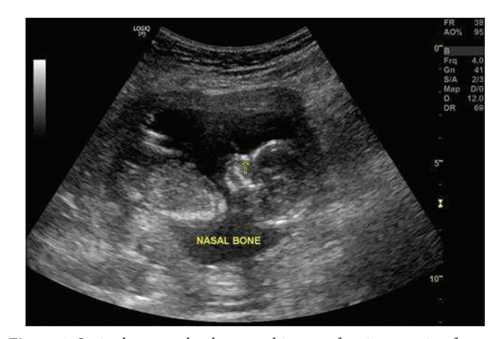
Figure 1: Sagittal gray scale ultrasound image of an intrauterine fetus of gestational age 16 weeks, 3 days showing the measurement method of fetal nasal bone (arrow) as described by Sonek et al. <sup>[5]</sup>

In contrast to Narayani and Radhakrishnan, the NBL at 16 and 22 weeks in our study was 3.5 mm and 5.8 mm, respectively, which was on the higher side as compared to them.