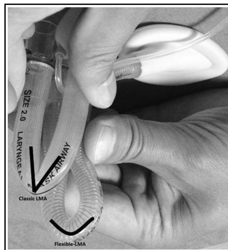
Fig.3: Kink difference between the classic LMA versus F-LMA.

We think that using a classic LMA is an important reason for the inadequate surgical visual field during adenoidectomies. There is a significant difference between the diameters of the classical LMA and the F-LMA (Fig.2). The advantages of using a F-LMA during adenoidectomies include a better surgical visual field after the placement of the mouth gag and, by preventing the LMA tube from being compressed or kinked under the mouth gag (Fig.3). As a result of these advantages, F-LMA is markedly superior over classical LMA for airway management in surgeries such as adenoidectomy and adenotonsillectomy.