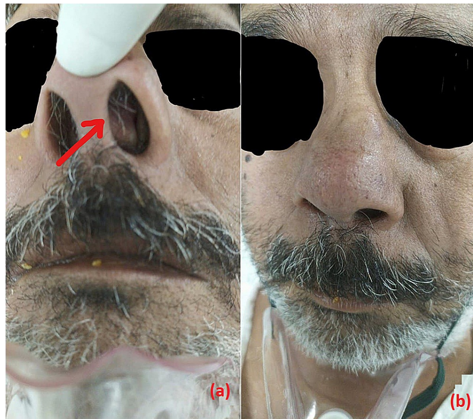
FIGURE 1: Caudal portion of the nasal septum was dislocated causing severe nasal obstruction in the left nostril (a) and the crooked nose (b).

The nasal prongs of the HFNC did not fit because of left nostril obstruction; therefore, displacement and obstruction at the base of the nasal cannula were inevitable. Therefore, we cut half of the nasal cannula for the left nostril so that it was easily fitted and undisplaced without any obstruction after application. Therefore, for better titration of \text{FiO}_2 , we applied HFNC and achieved the target \text{SpO}_2 .