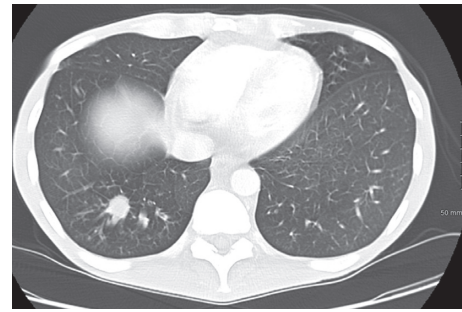
FIGURE 2: Contrasted CT of the chest showing a 16 mm right lower lobe nodule.

anticipating 12 months of treatment. In addition to prophylactic, trimethoprim/sulfamethoxazole 800 mg/160 mg one tablet orally and azithromycin 1500 mg orally once per week were started. He was not immediately started on antiretroviral therapy due to lack of inpatient access to these medications.