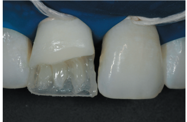
Figure 6- Reproduction of the deepest artificial dentin with more opaque characteristics

In natural teeth, there is a progressive decrease in chrome from the cervical to the incisal area, as well as from the most internal towards the surface of the tooth 17 . These differences should be reproduced