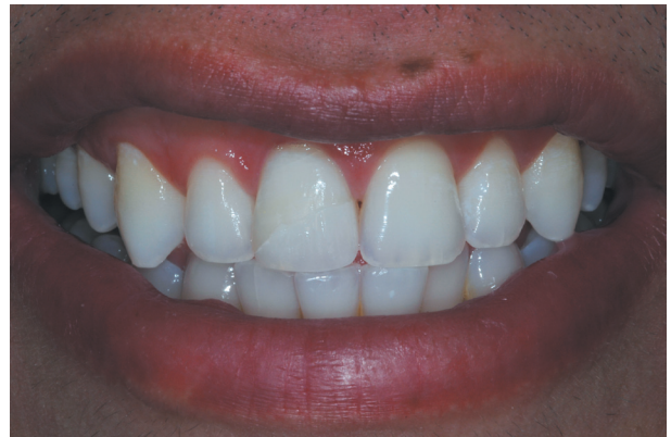
Figure 1- Initial case, showing inadequate reproduction of the polychromatic aspects of tooth

A common mistake in color selection step is to use ceramic shade guides. These are not indicated because their use is specific for prosthetic pieces and they are fabricated from materials that differ completely from composite resins. In addition, it is difficult that the color selected in the ceramic shade guide present any similarity to the corresponding resin color that will be used in the restoration