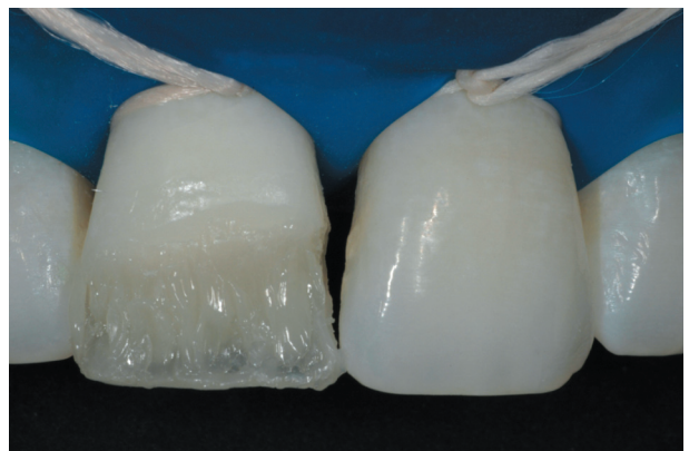
Figure 8- Application of Amaris® TL+high opaque to mimic the effect of opalescent halo. Amaris® HT was inserted to reproduce the incisal translucency

in order to achieve the harmonious and natural aspect of the restoration. When reproducing the artificial dentin localized in the inner part of the restoration and directed to the cervical third, the chrome should be increased in one number (Figure 6). This resin must present a high-chrome shade in order to simulate the optical properties of the tooth.