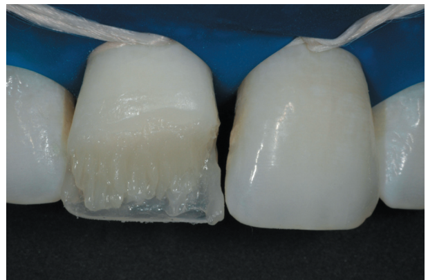
Figure 7- Application of Amaris® O1 to reproduce a more superficial dentin