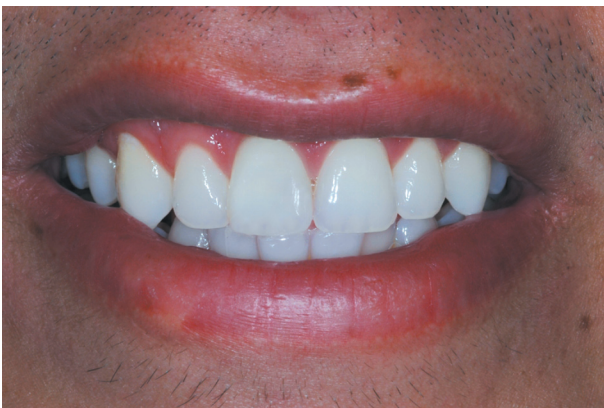
Figure 10- Final esthetic outcome