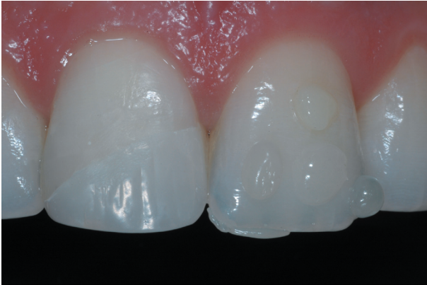
Figure 3- Shade selection performed on a clean tooth under the natural humidity, with a large combination of composite resins attempting to identify the fine shade differences at each tooth region