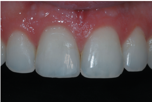
Figure 11- Follow-up at 12 months