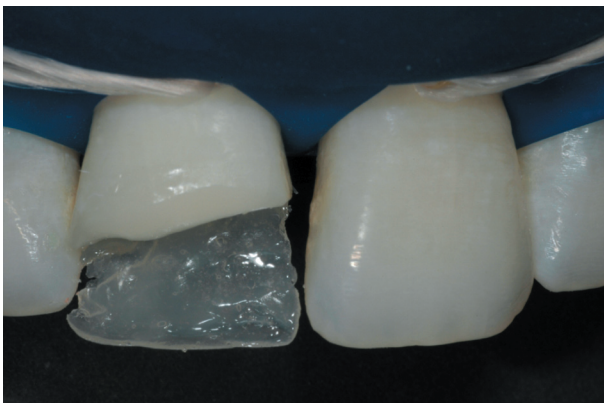
Figure 5- Application of translucent resin to reproduce the palatal portion of the tooth. Note the translucency achieved by Amaris® TL, ideal to reproduce the enamel that was lost