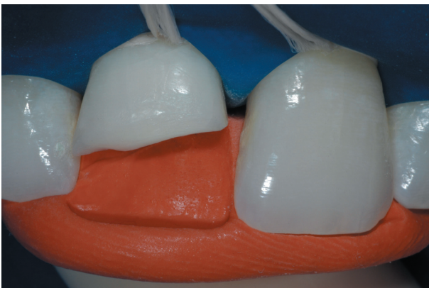
Figure 4- Artificial palatal enamel made using a silicon personalized guide