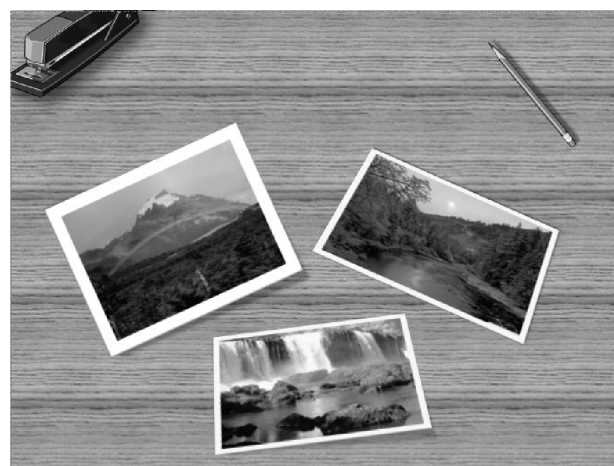
Figure 1 Examples of computerized tasks.