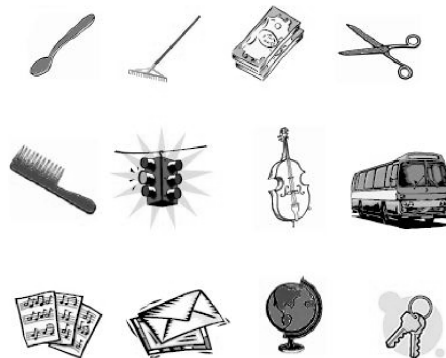
Figure 2 Examples of paper and pencil tasks.

Try to memorize the items below. Try to use a strategy. Take all the time you need.