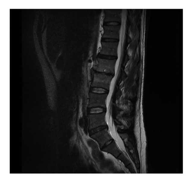
Figure 2: Sagital T1 MRI lumbosacral spine. 2 months later the epidural abscess has resolved and minimal marrow oedema is seen in L2 and L3 vertebra.

2 weeks and then to continue with oral antibiotics for at least a further 6 weeks depending on clinical improvement. Repeat bloods and MRI scans were performed to monitor the response to antibiotics (Fig. 2).