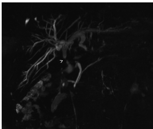
Fig. 3. MRCP showing a stricture at the level of the porta-hepatis (arrowhead).

It's noteworthy mentioning that bile duct injury (BDI) sustained during laparoscopic cholecystectomy (LC), differ from those sustained during open cholecystectomy (OC) [9]. BDI following open cholecystectomy remain asymptomatic for a long period of time. Once strictures develop, patients present with a picture of obstructive jaundice [9,10]. Similarly, neuromas of the bile ducts became symptomatic, months to years following surgery [6,7]. This could explain the fact why all cases of bile ducts neuromas, were reported in the era of open cholecystectomy [7].