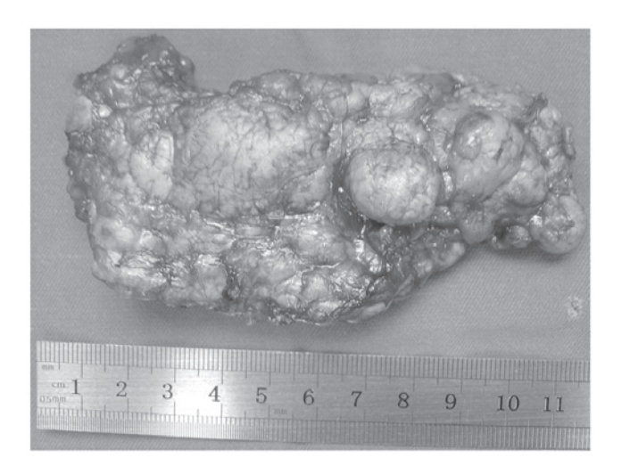
Figure 3. Macroscopic appearance of the adrenal glands of a patient.

Imaging examination. MRI examinations revealed that the pituitary gland was normal in 17 patients; however, MRI of the pituitary gland was not performed in the remaining six patients. Observations from the CT scans revealed bilateral adrenal nodules of soft tissue density, measuring \leq 5 cm, and irregular nodular masses in the adrenal glands. In addition, the CT scans demonstrated that the adrenal lesions with macronodularity were significantly enlarged (Fig. 1), and the largest diameter of an adrenal nodular was 6 cm.