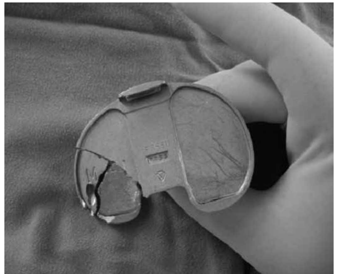
Figure 3- Fracture of the tibial component of case 1.

The patient was a 72-year-old man with normal body mass index, who presented osteoarthritis and underwent total arthroplasty on the left knee in January 1994, at a private hospital in the state of Rio de Janeiro. The PCA prosthesis model was used (Howmedica®). The patient underwent successive revisions with the physician responsible for this, but