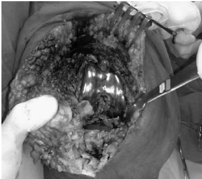
Figure 2 – Intraoperative view of case 1.