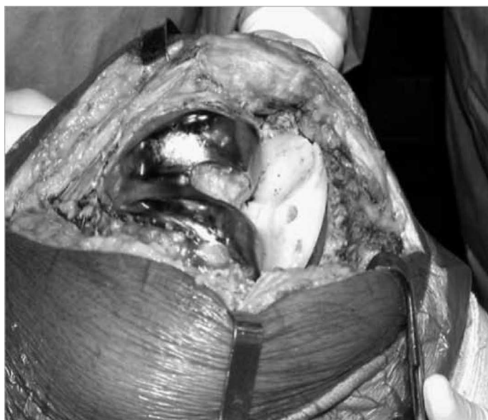
Figure 5 – Intraoperative view of case 2.

ligament balance, appropriate precision instruments and a good-quality durable implant.