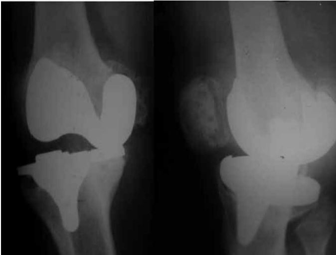
Figure 1- Preoperative radiograph of case 1.

fracture in the tibial component (Figure 1). TKA revision surgery was indicated, and this was performed in August 2009 (Figures 2 and 3). During the immediate postoperative period, we observed pain relief and functional improvement of the knee.