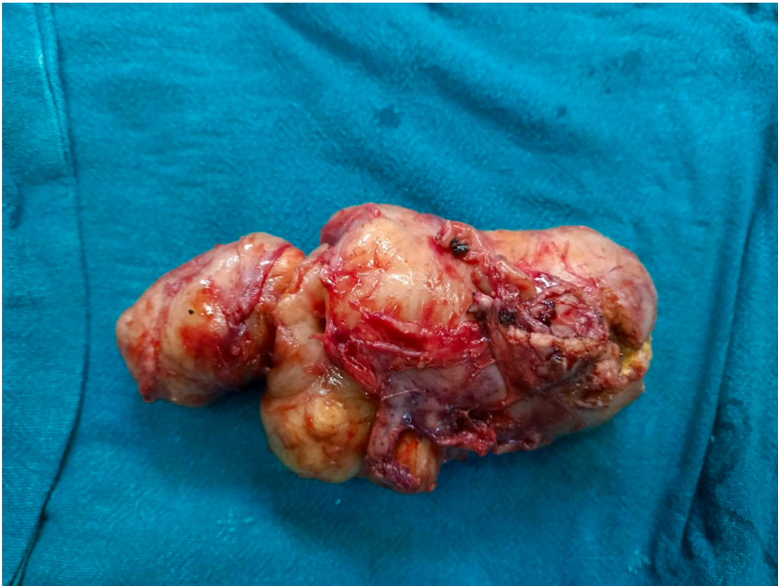
Fig. 2. Gross specimen of the resected pelvic mass.