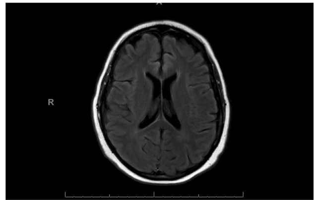
Image 1 Axial section of MRI Brain FLAIR showing normal cerebral structures

Serology was negative for GQ1B antibodies. Nerve conduction velocity studies (NCVS) revealed absent sural response and decreased peroneal motor response and the median and ulnar motor responses were of low amplitude. Electromyography demonstrated borderline reduced recruitment with borderline high amplitude, long duration motor unit potentials in the triceps, deltoid, vastus medialis, and tensor fascia lata muscles. Plasma exchange was continued for a total of five sessions. Her symptoms gradually improved and the patient was subsequently extubated. The