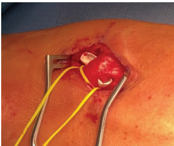
Figure 1. Polytetrafluoroethylene band is placed around a fistula.

proximal arteriovenous anastomosis (PAVA), and revision using distal inflow. 3 Banding aims to increase the resistance in the fistula thereby diverting flow down the native artery. Although technically uncomplicated, banding procedures have previously been demonstrated to have lower rates of access preservation and higher rates of persistent symptoms. 5 Intra-operative digital plethysmography or flow monitoring may increase the success of the banding procedure, and have been used with varying success. 6,7