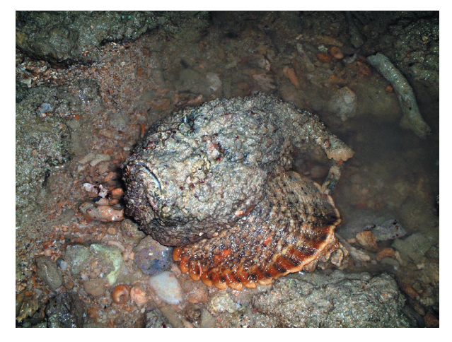
Fig. 1. Synanceia verrucosa Block et Schneider.