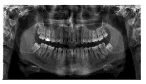
Fig. 2. Multilocular pneumatization of the articular eminence seen on the left side

The purpose of this paper was to determine the prevalence and variation of PAT among Iranian adult patients. Also, we compare other studies from different geographic populations to our results.