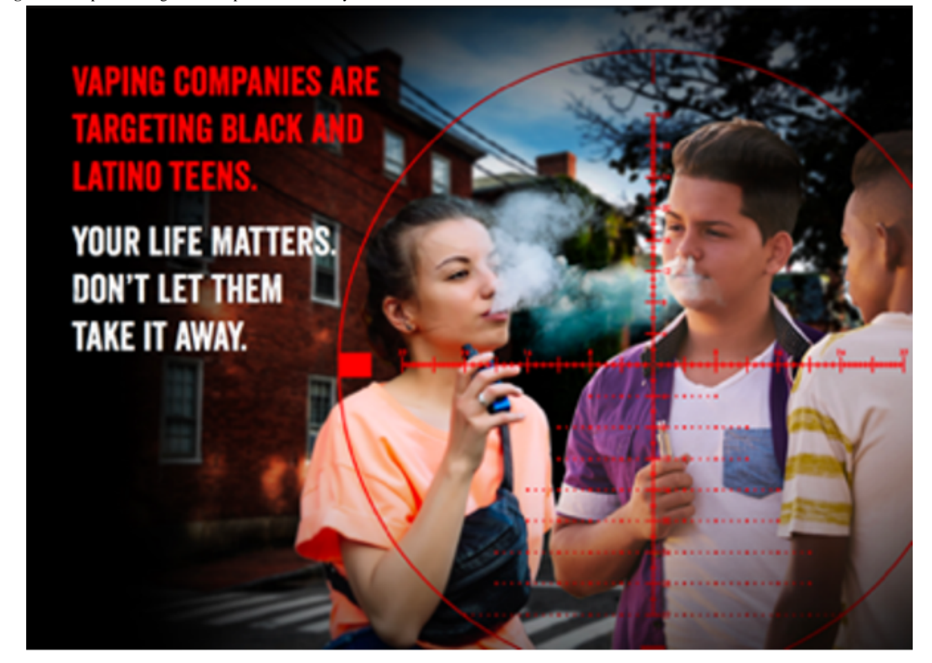
Figure 4. Graphic message on the topic of self-efficacy.

people, music, and culture. Both English- and Spanish-speaking participants were unfamiliarized with the gender-neutral terms "Latinx" and "Latine." So, they decided to use the term "Latino," as it "sounds nicer" and is a term that unites all Latinos in general. Participants suggested using the sentence "Your life matters" in light of the Black Lives Matter movement (Figure 4).