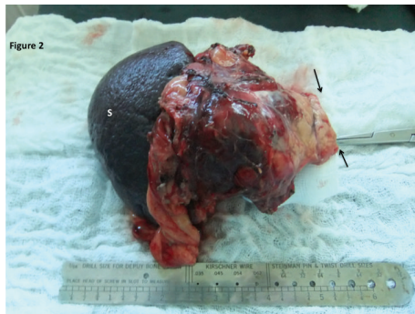
FIGURE 2: The specimen has been resected en bloc with the spleen (S) through a laparoscopic approach. Black arrows point to the macroscopically clear resection margin at the pancreatic tail.

a clinical diagnosis of symptomatic cholelithiasis. Ultrasound revealed a discrete pancreatic tail mass, approximately 2.5 cm in diameter. There was a characteristic cystic degeneration with associated calcifications centrally within the lesion. Tumor markers were within normal limits. A distal pancreatectomy was again performed, this time using the open approach. The splenic artery and vein were both suture ligated and pancreatic tail was transected. A 19 Fr. drain was left at the resection margin. The spleen and pancreatic tail were excised en bloc through the left upper quadrant subcostal incision (Figure 3). Postoperative recovery was uneventful, with hospital discharge on day 4 and drain removal on day 8 after operation.