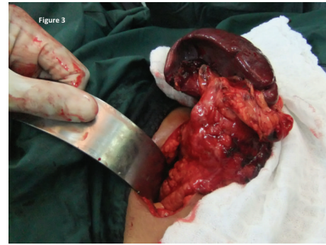
FIGURE 3: Open pancreatectomy being performed through a subcostal incision in the left upper quadrant.

On gross pathologic examination of the excised specimen, a 21 mm encapsulated tumor was noted in the pancreatic tail 2.2 cm from the resection margin. The cut surface was tan-brown in color and there were focal areas of central necrosis and haemorrhage. Associated with the necrosis, there were areas of cystic degeneration. On microscopic examination, the tumor was composed of regular ovoid cells with small central nuclei and eosinophilic abundant cytoplasm (Figure 4). There were no mitoses present and no capsular, lymphatic, or vascular invasion was seen. Immunohistochemistry staining was positive for neuron