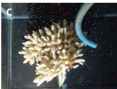
Figure 1 | Photographs of spawning pieces from No. 3 colony of Acropora tenuis in 2012 under each treatment. (A), control; (B), DA (dopamine) treatment; (C), DA + PIM (dopamine antagonist, pimozide) treatment.