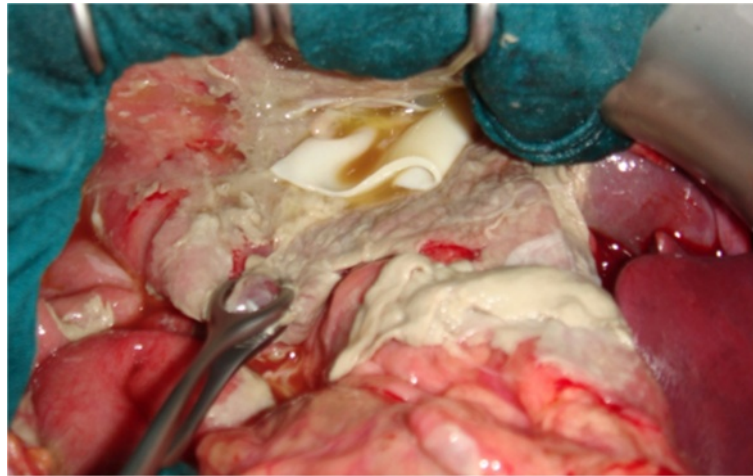
Figure 5 Intraoperative appearance of a cyst in the abdomen.

intraperitoneal fluid. Unroofing the cyst, capitonnage and external drainage in all patients, omentoplasty in two patients, were the methods used to manage the cysts. Four patients had two or more of these procedures. No patients died in the early postoperative period. A total of seven complications developed in six patients. biliary fistula developed in two patients. Other complications were prolonged ileus, pulmonary infection, and wound infection, one each. Biliary fistula closed spontaneously in two of the fistula patients. Sites of the primary cysts, surgical procedures, and postoperative morbidities are shown in Table 2.