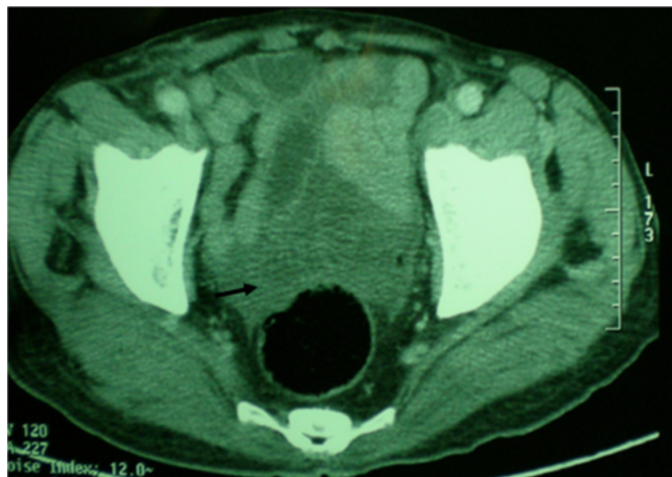
Figure 4 Axial contrast enhanced computed tomography images demonstrate ruptured hydatid lesion with free serous pelvic fluid.