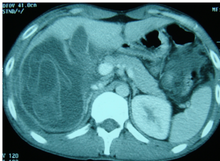
Figure 2 Axial contrast enhanced computed tomography images demonstrate ruptured hydatid lesion within right liver lobe.

to five liters of hydatid fluid with floating daughter cysts and purulent material was present in the abdomen (Figure 5). Partial pericystectomy and drainage was the most frequent surgical procedure. In two patient, there was direct communication between the cyst and the gallbladder, and cholecystectomy was performed. Procedures to fill the cystic cavities were applied after removal of the