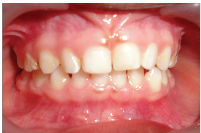
Figure 6: Follow-up after 2 months showing space closure

The protective anatomic feature of a child's face decreases the incidence of facial fractures. In young children (less than 5 years of age), the face is in a more retruded position relative to the "protective" skull, therefore, there is a lower incidence of midface and mandibular fractures and a higher incidence of cranial injuries. With increasing age and facial growth