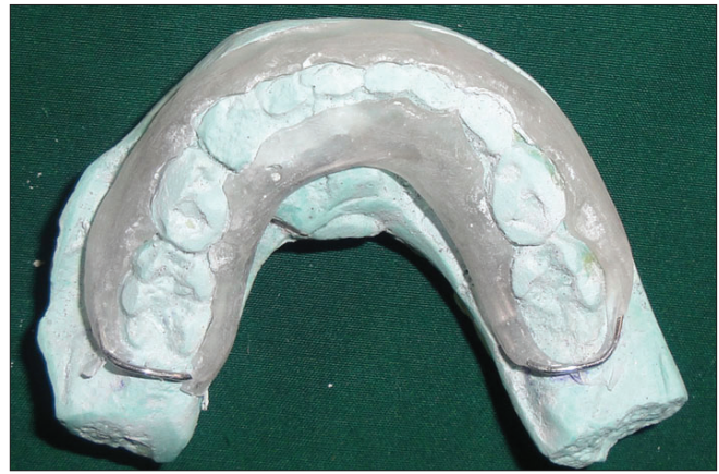
Figure 2: Mandibular cast with open occlusal acrylic splint