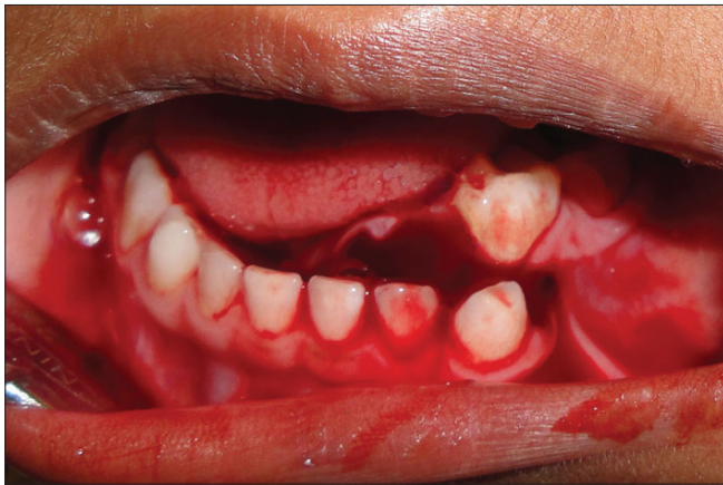
Figure 1: Preoperative photograph following trauma