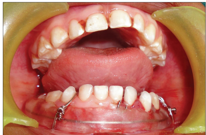
Figure 4: Postoperative orthopantomogram showing circum mandibular wiring