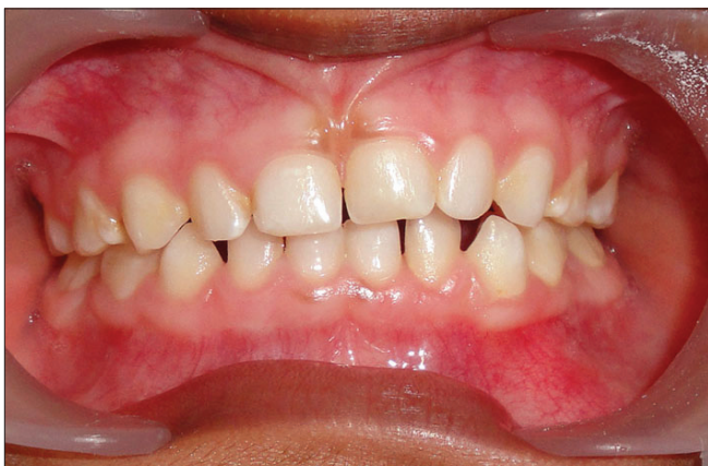
Figure 5: Spacing evident in incisor–canine region following wire and splint removal

and body fractures. The etiologies of mandibular fractures in children are usually falls and sports injuries.