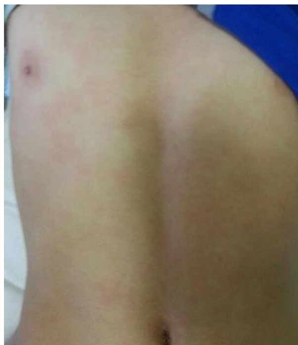
Figure 1. Marginatum-Like Eruptions on His Body

of 0.20 seconds. Echocardiographic findings revealed minimal mitral, aortic, and tricuspid valve failure. The patient was diagnosed with ARF carditis, and treatment was started with 2 mg/kg/day prednisolone. Benzathine penicillin made intramuscular. During the second day of hospitalization patient developed purpuric rash on his lower extremities. Purpuric rash, did not become pale with pressure. The skin biopsy revealed leucocytoclastic vasculitis (Henoch-Schönlein purpura) (Figure 2).