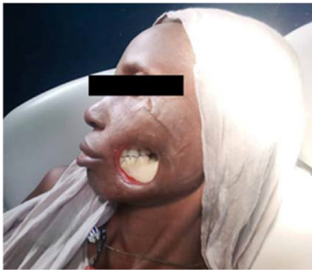
FIG. 1. Physical sequelae of Noma in a 32-year-old woman.

After analysis, we found a polymicrobial infection. Among these bacteria, we have isolated an Escherichia coli extended-spectrum beta-lactamase (ESBL). Double-disk synergy methods were used for detection of ESBL-producing strains. We observed a zone of inhibition enhanced by the action of two cephalosporin discs, Ceftriaxone and cefepime on the side facing amoxicillin + clavulanic acid was considered to produce ESBL (Fig. 2).