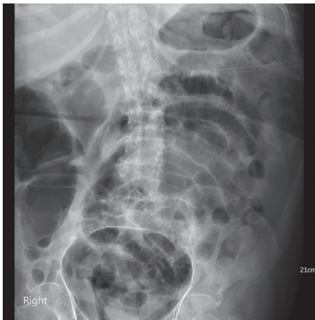
FIGURE 2: Diffuse gaseous distention of the bowel consistent with ileus seen on abdominal X-ray.

foci of soft tissue gas were noted within the aortic wall, extending from the arch to the distal descending aorta (Figure 3(a)). Treatment for emphysematous aortitis and pneumonia in a patient with penicillin allergy was initiated with intravenous vancomycin, aztreonam, and clindamycin, especially to cover anaerobes such as clostridial species.