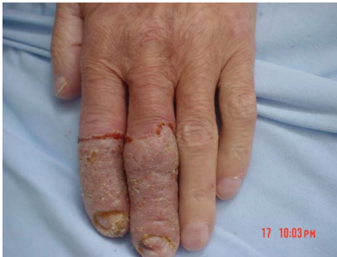
Fig. 2. Well-defined erythematous, crusted and vegetating plaques on the fingers.