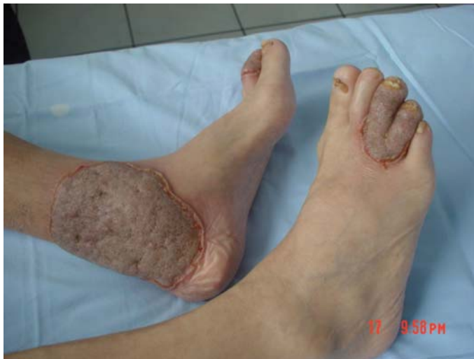
Fig. 1. Circumscribed vegetating plaques with erythematous elevated borders on the toes and medial malleolus of the left foot.

PV has a good prognosis with therapy. Its evolution tends to follow the progression of the underlying intestinal disorder [11]. It is important to be familiar with this vegetative skin condition, as correct diagnosis may lead to the uncovering of inflammatory bowel disease. The management of PV includes several agents, but definite guidelines are still lacking.