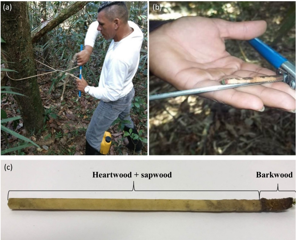
Fig. 1. Fieldwork: (a) collection of stem samples using an increment borer; (b) detail of the sample taken from the stem and (c) subdivisions of the samples that were considered in this research for calculation of wood density.

showed in the Fig. 2. Maracá Island has an area of \sim 101,000 ha, being 60 km long and some 15–25 km wide [1,2]. This region occupies the climatic transition between Köppen classification subtypes (Aw) and (Am), with annual average temperature of 26 °C and annual average precipitation of 2086 \pm 428 mm. The wettest months ( >300 mm month ^{-1} ) are from May to August, and the driest from December to March ( <100 mm month ^{-1} ) [1–4].