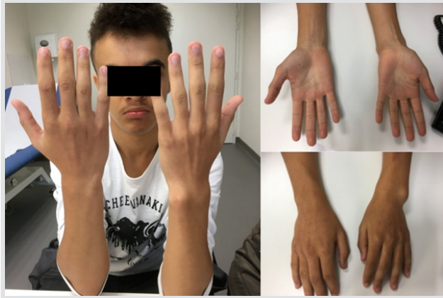
Figure 1: Clinical examination of the wrist with the protrusion of the ulnar head and the fovea sign.