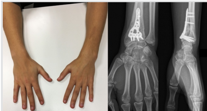
Figure 6: Clinical and radiological results at 6 months of follow-up. The clinical deformation of the wrist is reduced and the radioulnar index has been improved.