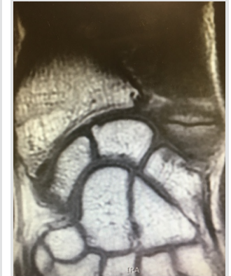
Figure 3: Magnetic resonance imaging of the wrist showing the ulnocarpal conflict with the related overpressure cysts.

orthopedically treated by a cast during 3 weeks. Since then, he presented pain in his wrist, especially at sport and when he was leaning on his left hand. His pain was quoted at 7/10 (visual analog scale) and he reported a severe handicap at sport. Clinical examination showed a normal range of motion of his wrist with a normal but painful pronosupination motion. It revealed distal radioulnar instability with a protrusion of the ulnar head (Fig. 1) without instability of the extensor carpi ulnaris tendon. The radioulnar ballottment test of the radioulnar joint, the fovea sign, and the chair test were positive. The clunk test was negative. The symptomatology was marked by a severe functional concern when leaning on his hand during gym classes or when playing basketball. The patient-rated wrist evaluation (PRWE) score was at 51/100 (pain = 31, function = 20), the QuickDASH score was at 43/100. The pain was specifically localized on the ulnar side of the wrist by the patient. No nerve compression or vascular signs were detected. X-rays of the wrist revealed a shortening of the radius with a high radioulnar index (11mm on the anteroposterior view) and an ulnocarpal impingement (Fig. 2). This was highlighted on the magnetic resonance imaging T1 sequence of the wrist that revealed overpressure cysts of the triquetrum (Fig. 3). The radioulnar joint surface on the radial side was flat[4]. A