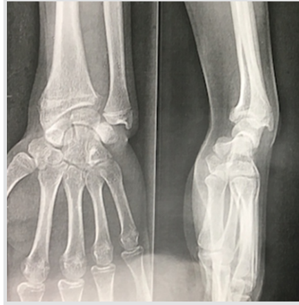
Figure 2: X-rays of both wrists.