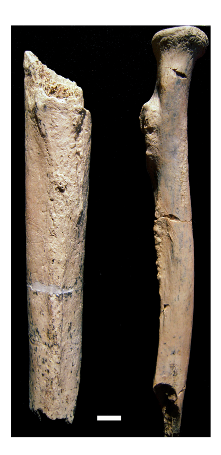
Figure 2. The right femur (OH 80-12; left side of image) and right radius (OH 80-11; right side of image) of the OH 80 hominin from Level 4 at the BK site. Both fossils are shown in posterior view; superior is at the top of the image; the bar scale = 1 cm. doi:10.1371/journal.pone.0080347.g002

The neck is also relatively constricted mediolaterally (14.8 mm), but quite robust anteroposteriorly (19.1 mm). The dimensions of the neck, as well as those of the bicipital tuberosity (maximum length = 33.9 mm;superoinferior maximum transverse width = 19.0 mm), are absolutely and relatively larger than those documented for any other Pliocene and Pleistocene hominin radius specimen [24,25,28,29]. The overall massiveness of OH 80-11, and specifically that of its bicipital tuberosity, suggests that the individual from which the specimen derived possessed large biceps brachii muscles and the ability for application of great strength in forearm flexion. In contrast to the more anteriorly positioned bicipital tuberosities of definitive Homo radii, OH 80-11 shows a more medially placed tuberosity. However, the longitudinal axis of OH 80-11's bicipital tuberosity does not intersect the axis of its interosseous crest, as is common in nonhuman apes and in some Pliocene and Pleistocene hominin radial specimens [30,31]. The longitudinal axis of the interosseous crest of OH 80-11 is posterior to its bicipital tuberosity. Thus, if we are correct in our assignment of OH 80-11 to P. boisei (see below), then, necessarily, the posterior position of this axis in H. sapiens is not an autapomorphy.