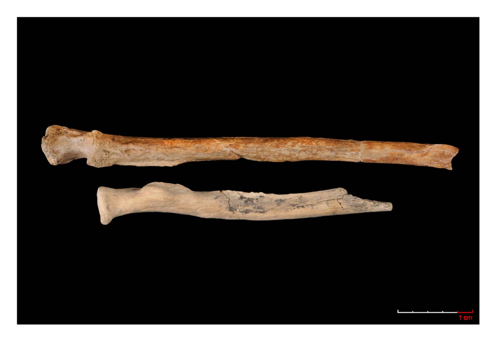
Figure 4. Ulna (OH36) found in upper Bed II and attributed to Paranthropus (upper) compared to the OH80-11 radius (lower). doi:10.1371/journal.pone.0080347.q004