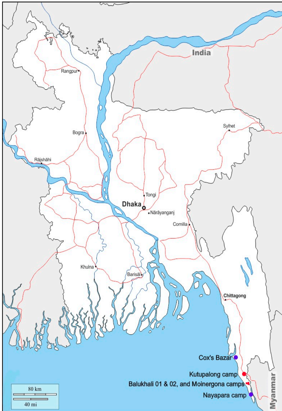
Figure 1. Map of Bangladesh showing Cox's Bazar and study camps in red dots.

In 2017, following a large influx of Rohingyas into Bangladesh, the Directorate General of Health Services (DGHS), MFW, Bangladesh approved immediate commencement of the study without prior ethics approval (Ref: DGHS/PHC/Rohingya/2017/163) as understanding the refugees' health status and risks was considered critically important for the refugees themselves and for the host