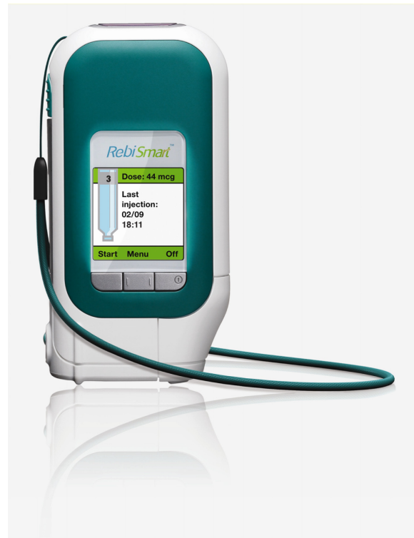
Figure 1 The RebiSmart™ device.

This was a Phase IV, observational, open-label, multicenter study of patient use of and response to an electronic auto-injection device in the UK and Ireland (NCT01195870). Patients who were treatment-naïve to sc IFN \beta -1a (Merck Serono S.A., Rebif®; Geneva, Switzerland) were given the