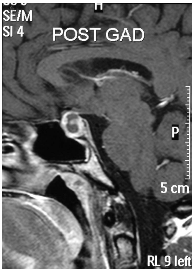
Figure 2 Magnetic resonance T1-weighted contrast-enhanced imaging; sagittal view.

KM assisted with writing the paper, supervising and designing the study.