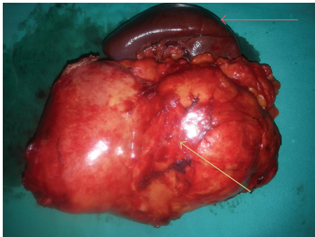
FIGURE 3: Total cystectomy and splenectomy specimen (red arrow shows the spleen and yellow arrow shows the cystic mass).

soft tissue tumors, retroperitoneal abscess, cystic lymphangioma, embryonal cyst, ovarian neoplasms, teratoma, and other cystic and necrotic solid tumors [1, 4, 6]. Especially in endemic regions such as Turkey, the hydatid cyst must always be considered in the differential diagnosis of cystic lesions [1, 5]. The hydatid cyst is usually asymptomatic and the clinical presentation of HD depends on the organs involved, the size of the cysts, their site within the affected organ, the presence of cyst rupture, spread of protoscolecocytes, and bacterial infection-related complications [1, 6, 7]. The definitive diagnosis of a retroperitoneal hydatid cyst requires a combined assessment of clinical, radiological, and serological analyses [1, 8]. Routine laboratory tests including complete blood counts and liver function tests are generally normal and nonspecific but eosinophilia occurs in 25% of cases [5–7]. Serological tests contribute to diagnosis. Immunoglobulin G antibody detection by enzyme-linked immunosorbent assay