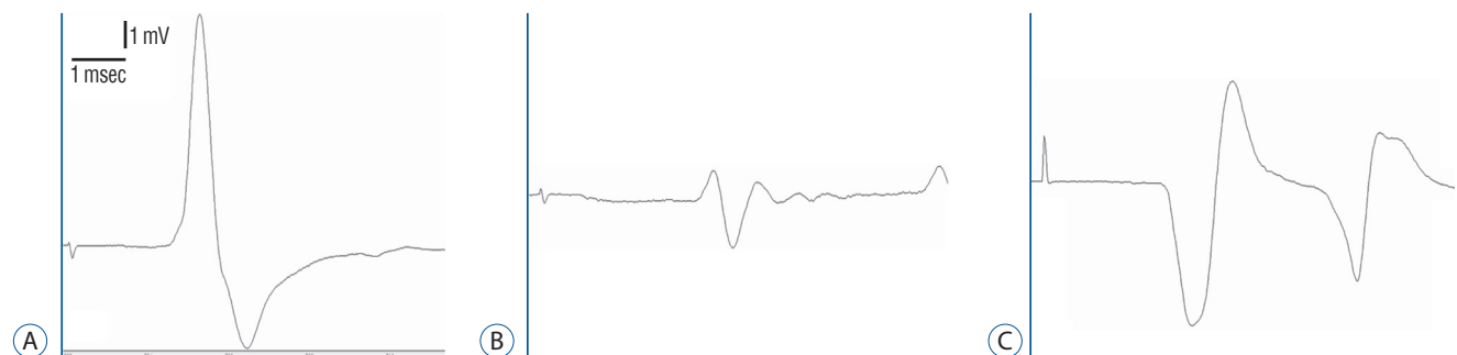
Fig. 1. Electromyography of (A) control group, (B) surgery+saline group, and (C) surgery+gallic acid group.

Values are presented as mean±standard error of the mean. * p <0.05, † p <0.001; surgery+saline group compared with control group. ‡ p <0.001, § p <0.001; surgery+gallic acid group compared with surgery+saline group. EMG : electromyography, CMAP : compound muscle action potential