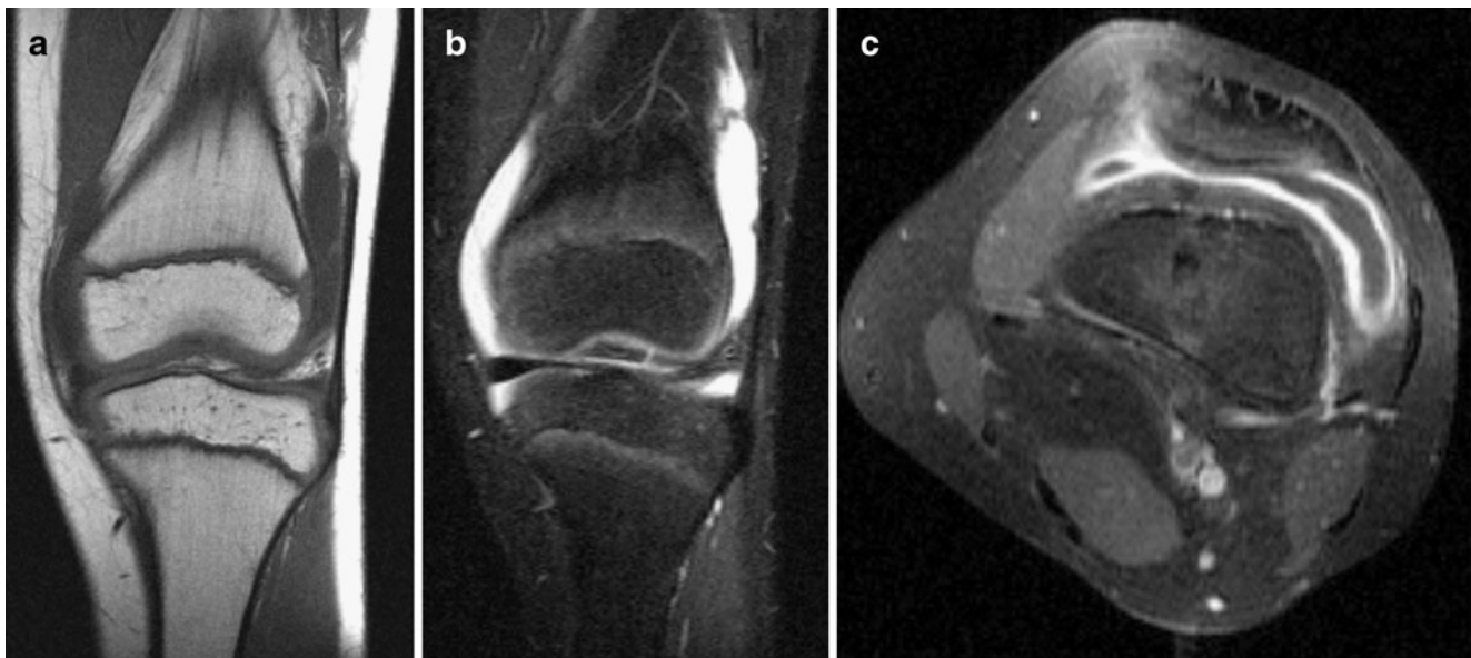
Fig. 3 MRI of the knee of a 13-year-old boy with confirmed PA. a Coronal T1-W SE and (b) coronal STIR show joint effusion, but no bone marrow oedema or soft-tissue oedema. c Axial contrast-enhanced T1-W SE with FS shows smooth synovium with intense contrast enhancement

groups in the occurrence of bone marrow oedema, soft-tissue oedema, synovial features and cartilage appearance that may help distinguish IA and JIA from other subgroups of arthritis. IA and JIA are the two most important groups to identify because of the need for early treatment. Previous studies have focused on separating JIA from TA [12–14] or described MRI findings in later phases of JIA [15–17, 22].