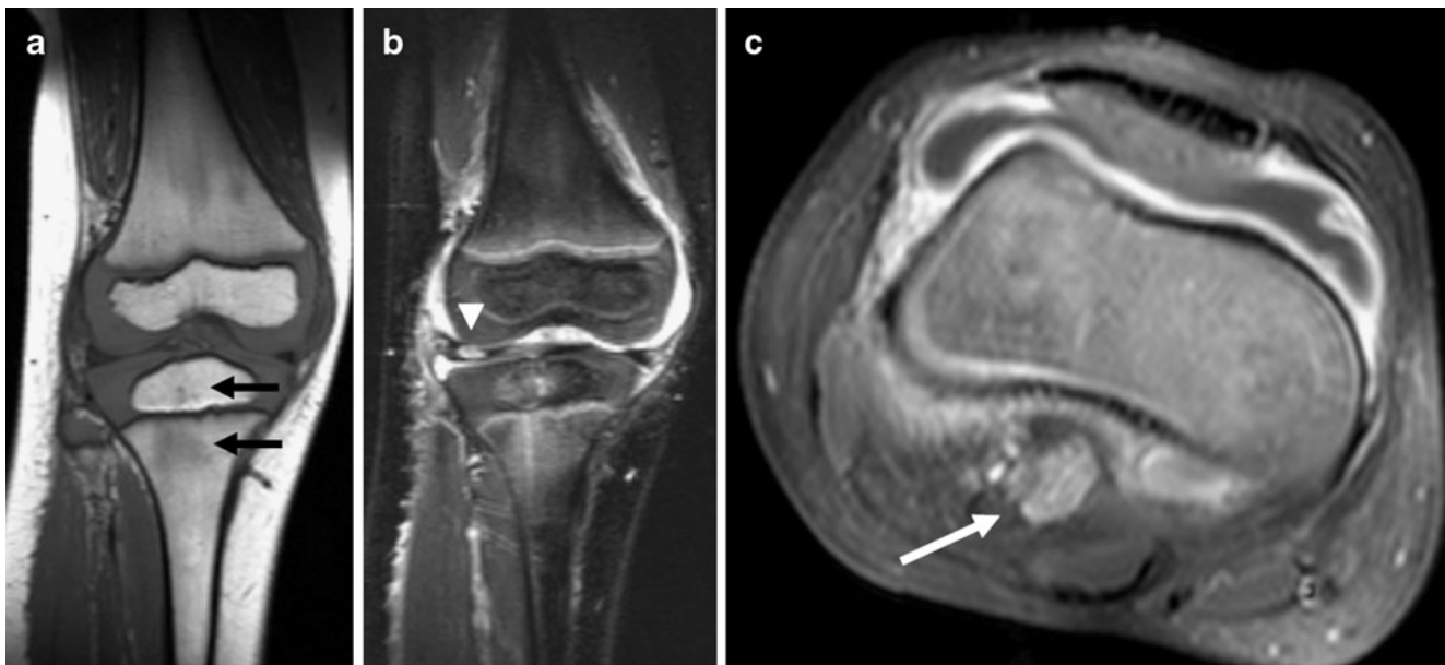
Fig. 1 MRI of the knee of a 3-year-old boy with confirmed IA. a Coronal T1-W spin-echo (SE) image shows bone marrow oedema in the tibial metaphysis and epiphysis (black arrows). b Coronal short tau inversion recovery (STIR) image shows bone marrow oedema in

the tibial metaphysis and epiphysis, soft-tissue oedema and a lesion in the lateral meniscus (white arrowhead). c Axial contrast-enhanced T1-W SE with FS shows smooth and intensely contrast-enhancing synovium, joint effusion and an enlarged lymph node (white arrow)