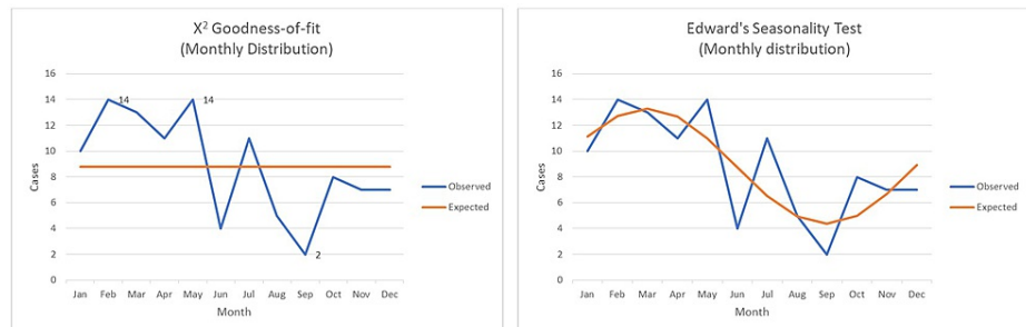
FIGURE 2: Monthly distribution and seasonal trend.

As to the monthly distribution of dog-bite incidents, there was heterogeneity in the frequency of cases ( X^2=19.66 , df=11 , p=0.05 ) with two observed peaks in February and May and a through in September. Edward's test was performed to detect the presence of seasonality. The monthly distribution of cases appears to follow a simple harmonic curve pattern that reaches a peak in March and a through in September. Specifically, the amplitude of the expected frequency curve was 0.51. No significant departure of observed frequencies from the fitted simple harmonic curve was detected ( X^2=10.43 , p=0.492 ) (Figure 2).