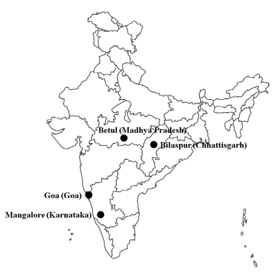
Fig. 1: map of India showing the location of collection of samples of Plasmodium falciparum isolates.

infections with multiple clones of P. falciparum in a single patient, we sequenced all 19 DNA fragments of the mt genome from both directions (2X coverage, see below) and excluded isolates showing double peaks in any single nucleotide position (Gupta et al. 2012). For each single-clone P. falciparum isolate, the 19 PCR-amplified products were separately purified with exonuclease and shrimp alkaline-phosphatase following standard protocols (Tyagi et al. 2014) and DNA sequencing was performed at an NIMR in-house facility following Sanger sequencing technology using an ABI 3730XL DNA Analyser (Applied Biosystems). For each P. falciparum isolate, all 19 DNA fragments downstream of the sequencer were individually edited using the SegMan and EditSeq modules of the Lasergene v.7 computer program (DNASTAR, Madison, USA), respectively and the sequences were manually assembled to form one complete mt genome. The newly generated whole mt genome sequences of the three isolates were submitted to GenBank with accessions KJ418723, KJ418724 and KJ418725.