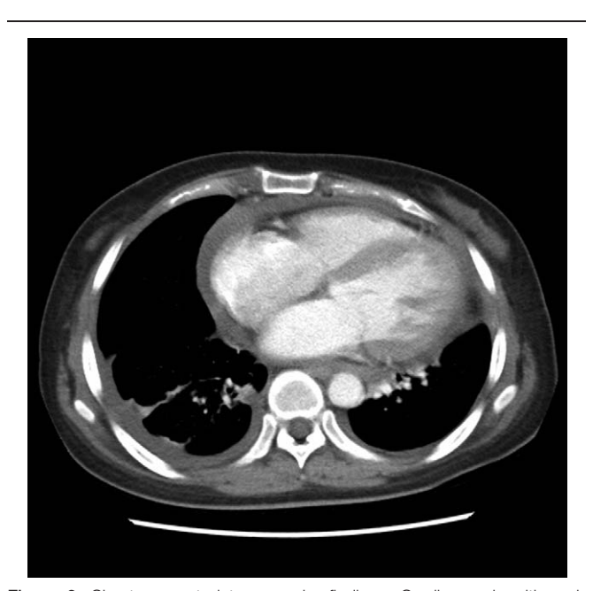
Figure 3. Chest computed tomography findings. Cardiomegaly with pericardial effusion, bilateral pleural effusions, probably loculate, without discernible pleural thickening.

Since previous reports of AAC in SLE were associated with an active disease flare, we considered AAC in this case as one of the manifestations of SLE (SLEDAI-2K 29 points). Therefore, we administered high-dose prednisolone (1 mg/kg) and hydroxychloroquine 400 mg for the treatment of AAC in SLE. After 4 days of the treatment, the symptoms and laboratory tests were improved. Follow-up CT and ultrasonography were preformed 1