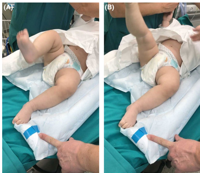
FIGURE 1 A, B Continuous kicking of the right leg and absent movements of the left leg

performed to rule out a fracture. X-ray was normal without signs of periosteal elevation. Ultrasound of the hip was normal without elements of joint effusion. The ultrasound of the knee joint showed edema of the muscles, with joint effusion. Blood tests showed increased CRP and ESR. Neutrophils and platelets were increased. We performed blood cultures that were reported later negative Table 1.