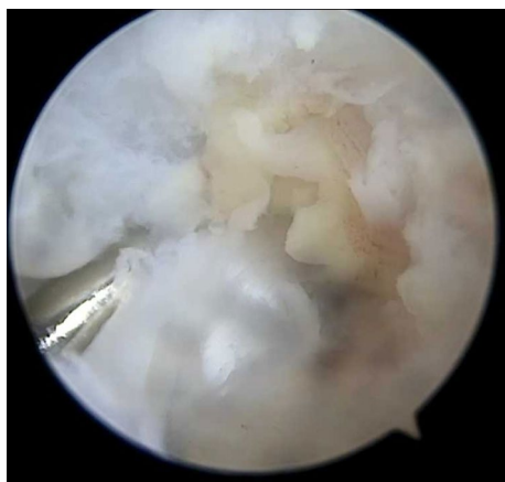
FIGURE 3 Arthroscopic picture with infected and hypertrophied synovium, in front of the ACL

In our infant, the early MRI investigation confirmed septic knee arthritis and the absence of osteomyelitis.