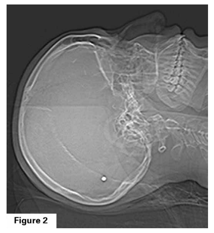
Figure 2. A bullet with 9x6 mm can be seen in the left posterior parieto-occipital area in the cranial CT sagittal cross-section

Neoplasms or foreign bodies in the cranium during pregnancy are extremely rare. According to the literature, although it is seen that there are many articles about fetal injuries due to firearms during pregnancy, the foreign bodies related to maternal intracranial gunshot wounds or the sharp object traumas haven't been reported. In this regard, we think that the case above will contribute to the literature. The literature has reported cases of gunshot wounds in pregnancy and the phenomenon that the trauma and foreign bodies cause injuries more on maternal extremity, abdominal organs, uterus<sup>(4,5)</sup>. The study of Wilson et al.<sup>(6)</sup> at which they examined six pregnant women whose two fetus can be kept alive were injured by firearms during wartime, and the study of Lin et al.<sup>(7)</sup> at which