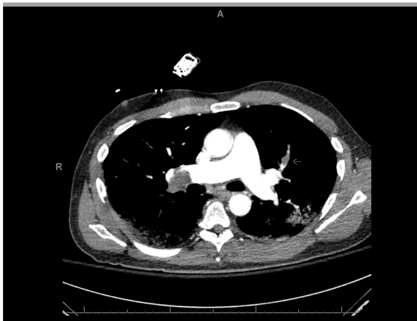
FIGURE 2. Computed tomography angiography (CTA) showing pulmonary embolus in the right main pulmonary artery.

were notable for a CRP 4.9 mg/dL, LDH 418 IU/L, D-dimer 788 ng/mL, Ferritin 290 ng/mL, and procalcitonin 0.17 ng/mL. Chest x-ray on admission did not have significant consolidation and CT of the chest with contrast revealed a large saddle PE with a large perfusion defect in the left lower lung (Fig. 3).