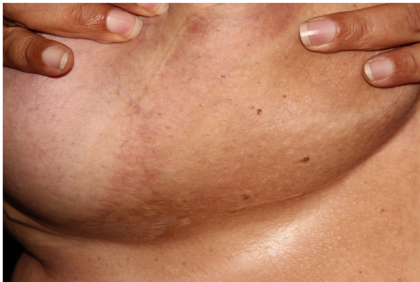
Figure 4 Complete resolution of lesions after loss of 20 kg.