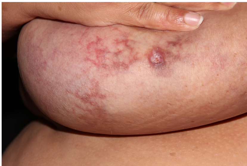
Figure 1 Large and pendulous breasts, with erythematous-violaceous reticulated plaques and some ulcerated areas.