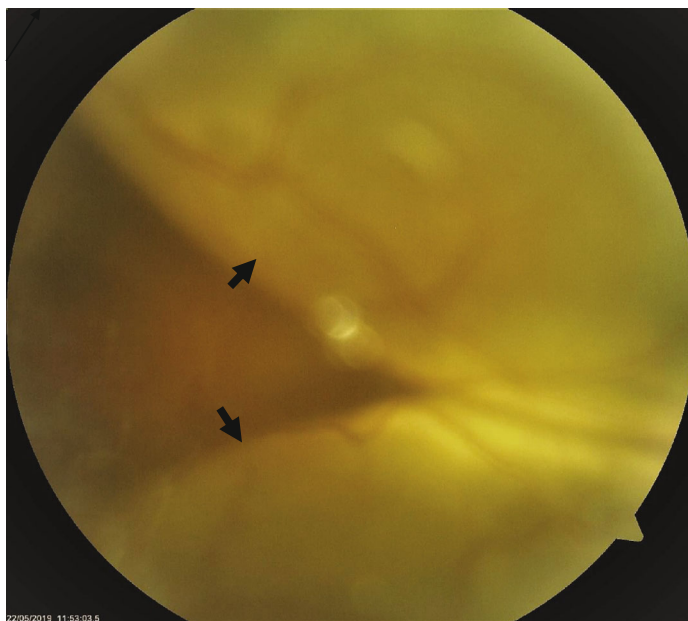
FIGURE 1: A VKH patient presenting in acute uveitic phase with bullous exudative retinal detachment (black arrows).

corticosteroids initiated during the early acute uveitis stage followed by slow tapering is required to suppress the inflammation. Addition of immunomodulatory agents along with steroids can improve the visual outcome and can also decrease the risk of cutaneous involvement [1].