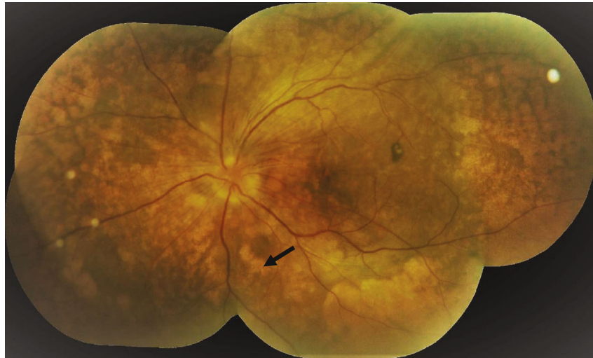
FIGURE 2: A VKH patient presenting in chronic stage with sunset glow fundus, multiple nummular chorioretinal depigmented scars, and pigmentary changes.