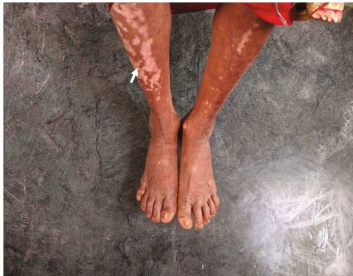
FIGURE 3: A VKH patient with extraocular manifestation (vitiligo).

along with ocular criteria there is presence of integumentary or neurological criteria, and complete VKH if both integumentary and neurological criteria are present.