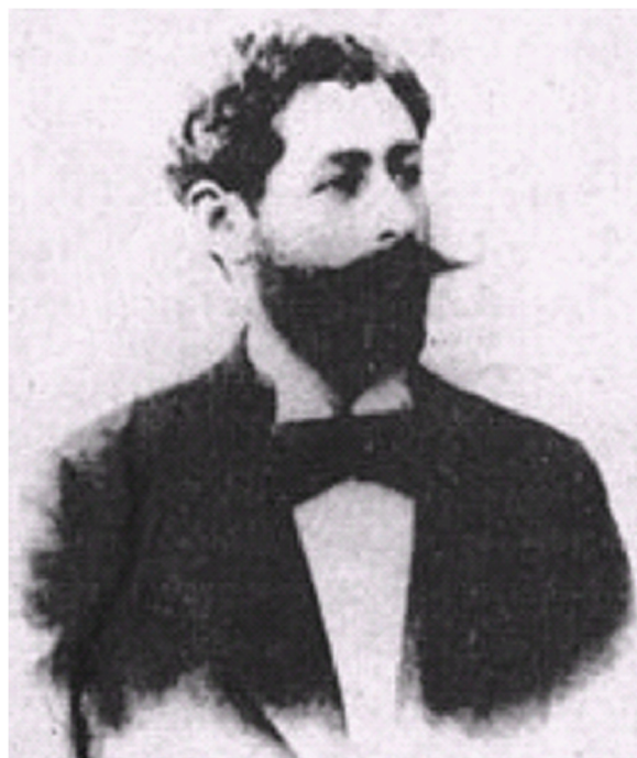
Figure 4 Peppo Acchioté (1870–1916).

phenomenon in the history of medicine: ‘the altogether innocent transmitter becomes identified as the originator of the idea when his merit lies only in having kept it alive (...) or perhaps in having put it to new or instructive use’ [20]. That said, not mentioning Devic and Gault’s unique contribution would mean committing what Merton called the ‘sin of adumbrationism’ [20]: While others had in fact reported on NMO before, it was they who gave it a name - and ‘[w]hat is a disease before it gets a name?’ (T. Jock Murray, Multiple Sclerosis: The History of a Disease , New York, 2005).