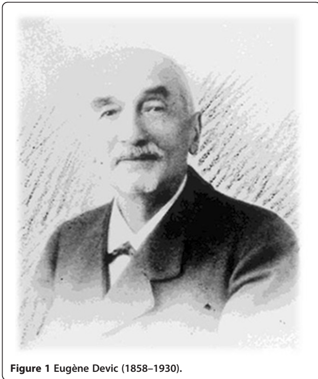
Figure 1 Eugène Devic (1858–1930).

pas de maladies, il n'y a que des malades » soit toujours vrai, il est certain cependant que, quand on parvient à réunir en un syndrome un ensemble constant de symptômes, il est certain, dis-je, que l'on peut proposer un nom servant à désigner le cas type, et sur les conseils de M. le Dr Devic, je propose celui de neuro-myélite diffuse, aiguë' [7].