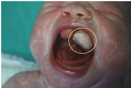
FIGURE 3: The epignathus, just after delivery, was shown in yellow circle.

solid mass. In the operation, following the excision of oral mass, incomplete cleft palate was surprisingly seen in the soft palate. In the histopathologic examination of the mass, the fat tissue was painted by S100 and surface epithelium with pancreatin [4]. Final histopathologic diagnosis was mature cystic teratoma. She underwent another surgery to excise accessory tongue and repair of incomplete soft palate cleft when she was 14 months old. Postoperative follow-up is normal after second operation.