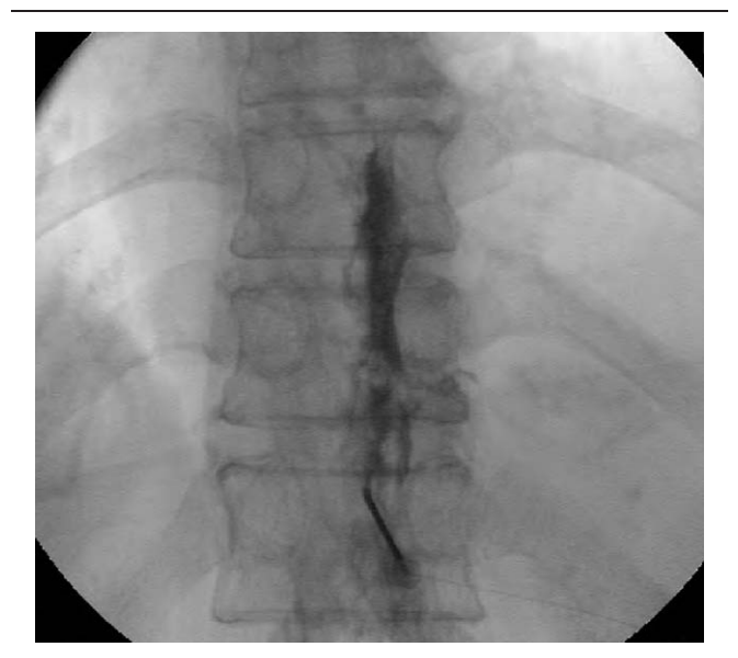
Figure 1. Fluoroscopic images of conventional continuous epidural block. The positioning of the catheter tip is confirmed using a contrast agent.

2.2.2. Continuous epidural block: epistim group. After the epidural space was confirmed using the loss of resistance technique, an epistim catheter (EpiStim catheter: 20-gauge, open-tip, 800-mm long epidural anesthesia catheter; Sewoon Medical Co., Ltd., Seoul, Korea) was inserted at the target vertebral level through the Tuohy needle. This epidural catheter was confirmed radiographically, and has a built-in conductive guide-wire (Nitinol; length: 1100 mm) with an 800-mm section inside the catheter and a 300-mm section exposed for connection to an electrical nerve stimulator. The cathode of the electrical nerve stimulator (EZstim; Life-Tech, Inc., Stafford, TX) was connected to the exposed guide-wire, and the anode was attached to an electrode on the patient's calf. Electrical stimulation of 0 to