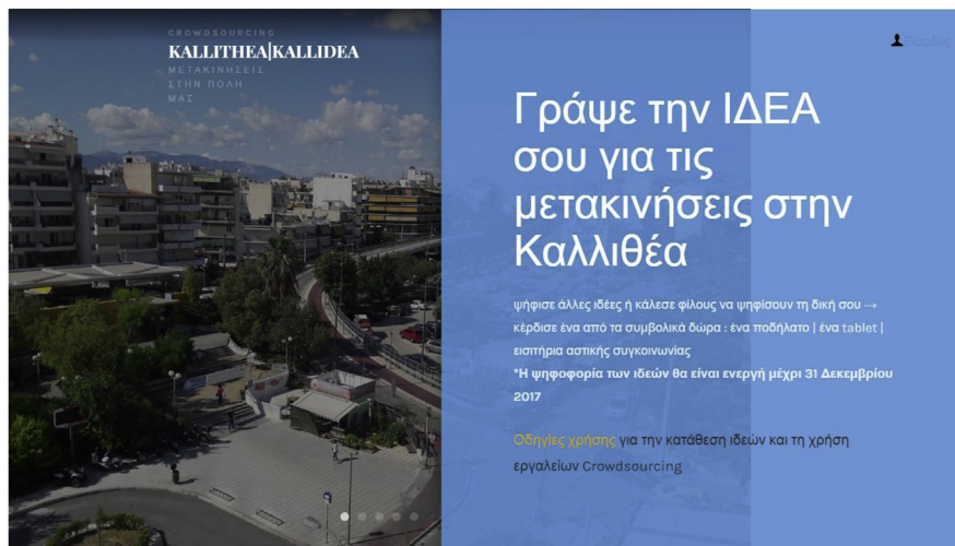
Fig. 3. Crowdsourcing platforms developed in order for citizens to submit their ideas about the future of their cities.