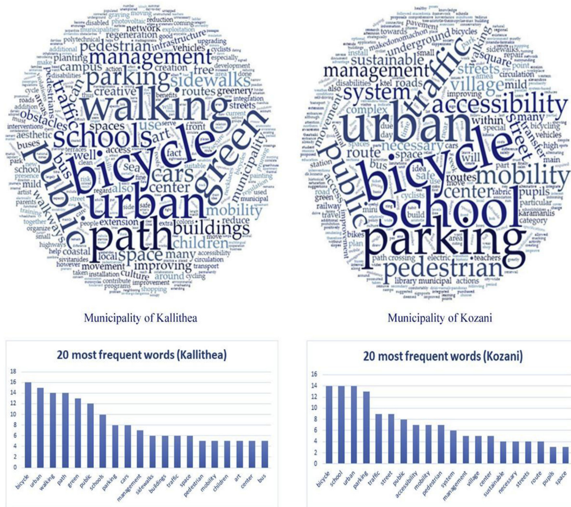
Fig. 4. Word cloud analysis, based on the ideas proposed by the citizens of Kallithea and Kozani through web-platforms. word cloud analysis logo.