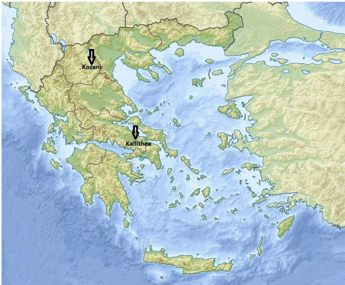
Fig. 1. Location map of Greece. A modification has been added (only in this paper) to the original map in order to show (approximately) the location of Kozani and Kallithea. Please refer to: https://commons.wikimedia.org/wiki/File:Greece_location_map.svg#filelinks (licence to copy, distribute and/or modify this document is provided in the above link).

Particularly today the role that Municipalities are asked to play has