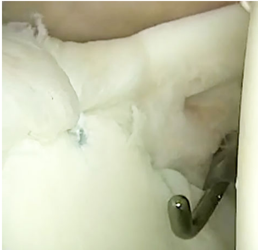
Figure 1. Right shoulder: viewing via the dorsal standard portal visualizing the final repair construct of a knotless SLAP repair.

second anchor at the 11-o'clock position (for the right shoulder) on the apex of the glenoid rim was performed. The repair was finalized in a knotless fashion as illustrated in Figure 1.