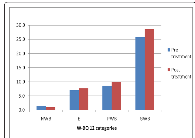
Figure 4 Comparison of pre and post treatment WBQ-12 scores.