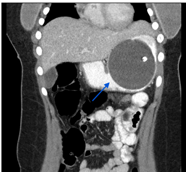
Fig. 2. Coronal CT showing IGB position and oral contrast distal to IGB (blue arrow).

acute pancreatitis. Oral contrast could be seen flowing freely into the proximal jejunum, excluding gastric outlet obstruction (Fig. 2).